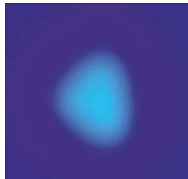
3 - LED Array at 15"