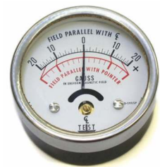
Analog Gauss Meter