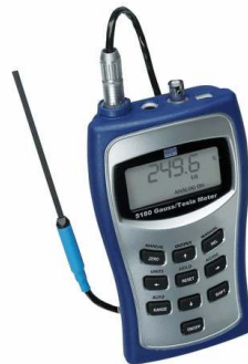
Digital Gauss Meter