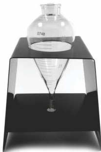
Centrifugal Tube with Stand